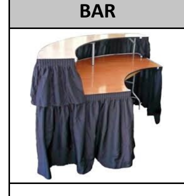
Serpentine Table Bar....$75.00 Comes with Black Skirting

Black Chair ...... $1.25 White Chair ...... $1.75