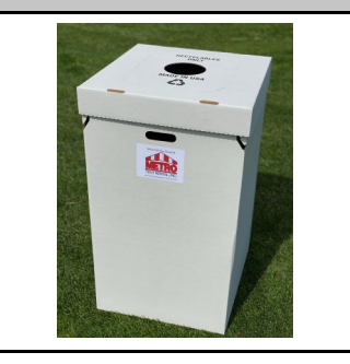
Garbage Cans ...... $10.00 55 gallon can with plastic liner Customers to keep and discard !